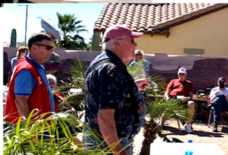
Meeting